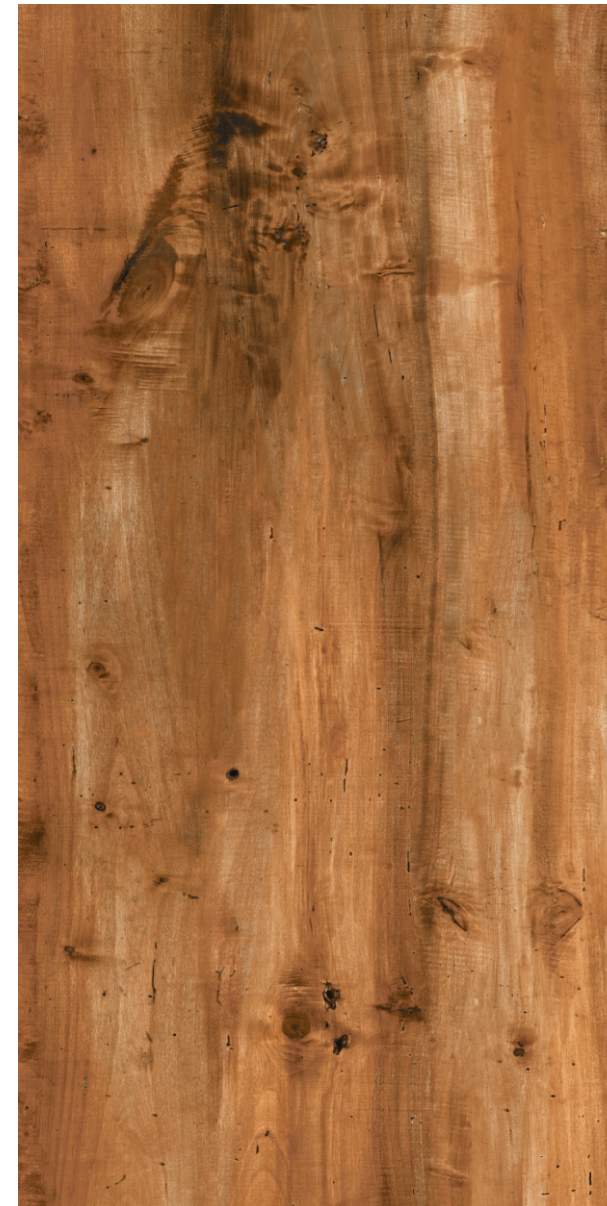
LUMBER WOOD WENGE