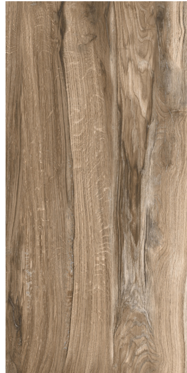
WALNUT WOOD NATURAL